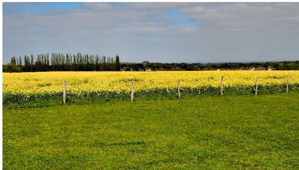
Crockenhill from the Gables

continue on until the junction with Tylers Green Road cross the road and take the footpath between the house to Old Chapel Rd then left back to the village centre.