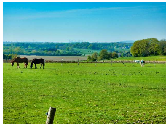
Docklands and Shooters Hill from Darns Hill