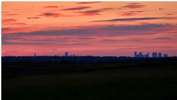
Sunset over London from Darns Hill