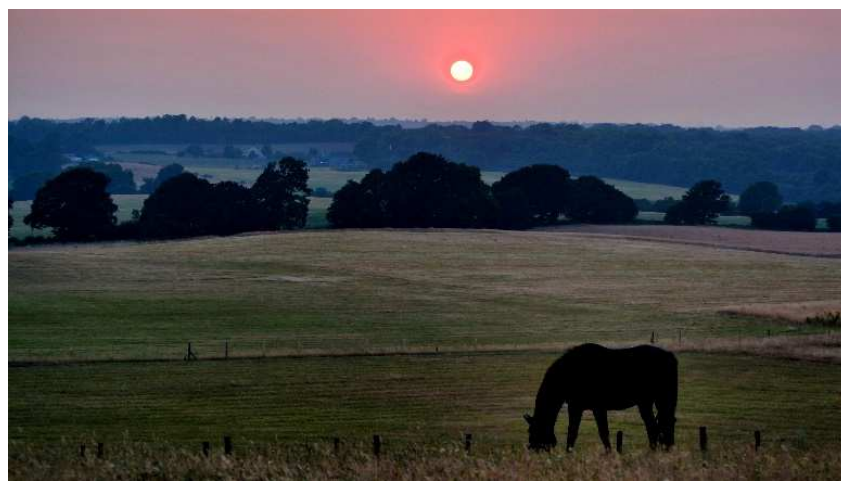
View from the Mount towards Shooters Hill & Docklands

At the road junction crossover into Tylers Green Road continue up the road to just pass Darns Hill and take the footpath on left between the houses into Old Chapel Road turn left and back to the Village centre.